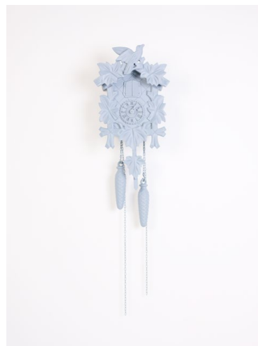
You are repetitive and productive but you dream of being free, 2025 Courtesy the artist and TARO NASU, Tokyo. Photo: Ryan Gander Studio