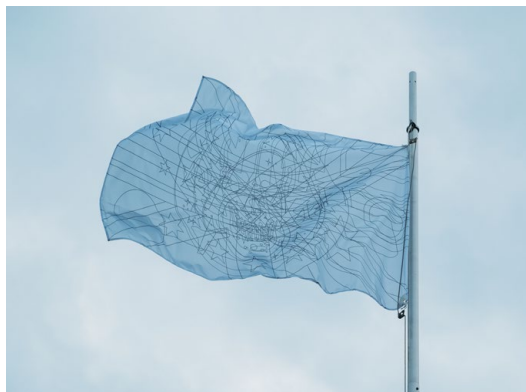
Centred on the periphery, 2023