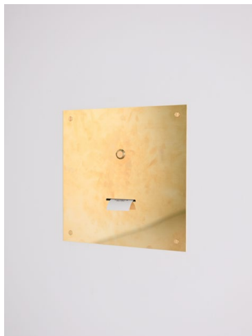
Idea Machine, 2024