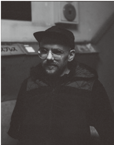
Courtesy of the artist. Photography by Kazushi Toyota_IG. © Ryan Gander.