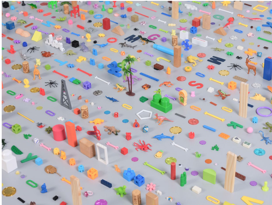
Closed systems, 2024 Courtesy the artist and TARO NASU, Tokyo. Photo: Ryan Gander Studio